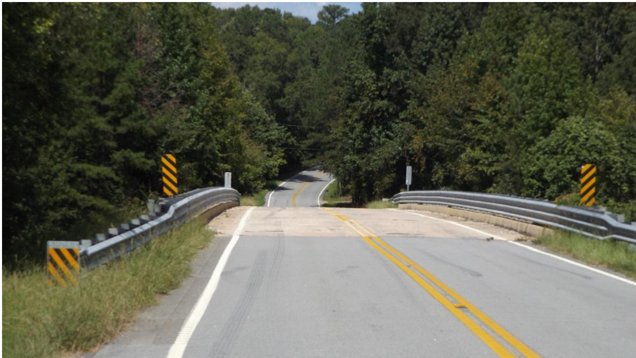
Figure 1 - Existing Bridge (looking north)

A non-intrusive visual assessment of the Old Hilton Road Bridge over I-26 was conducted in order to identify items that will need to be addressed during the construction phase of the I-26 widening project. This report is based on the visual assessment, the most recent Bridge Inspection Report, the most recent Structure Inventory and Appraisal Report, and plans for the existing bridge. STV did not conduct an inspection similar to the Biennial Bridge Inspection, did not generate any calculations in regard to the condition of the existing bridge, and did not generate any load rating calculations.