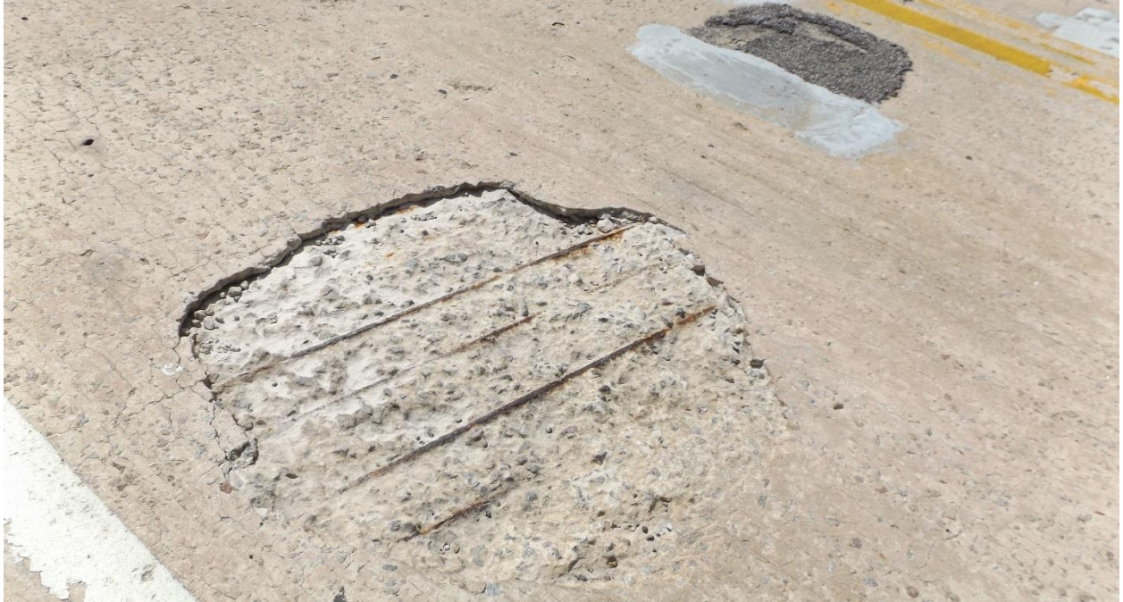
Figure 4 – Exposed Rebar in Concrete Deck