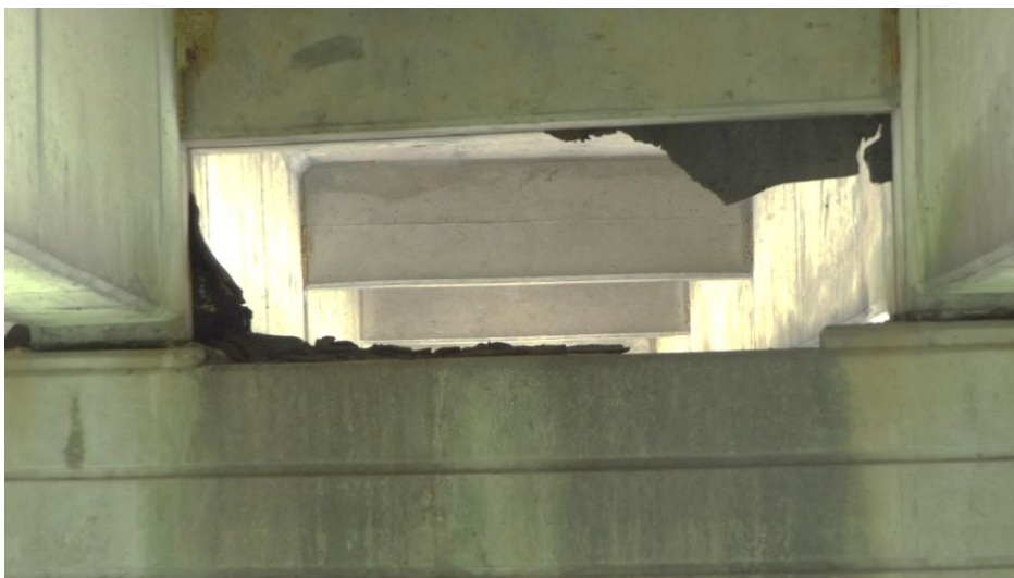
Figure 8 - Expansion Joint material falling through joint opening