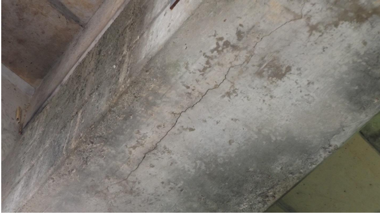
Figure 10 - Crack in Bottom of Pier Cap

The interior bents show minimal signs of deterioration with the exception of a crack in the bottom of one of the concrete caps (see Figure 10). No delamination or spalling of the pier caps or columns was noticed. The most recent Bridge Inspection Report does document some cracking in the interior bent caps.