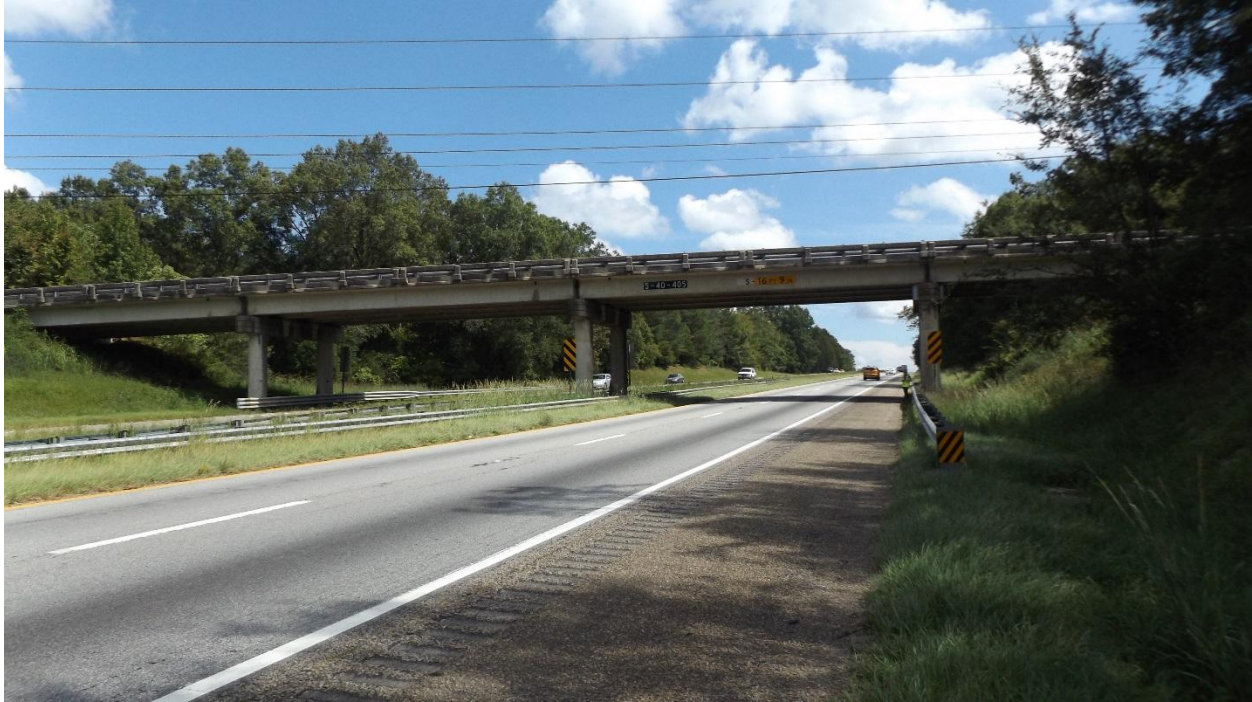
Figure 2 - Existing Bridge (looking east)