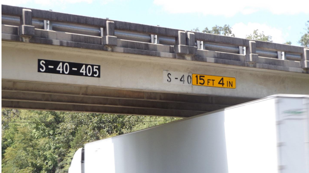
Figure 11 - Vertical Clearance

The posted minimum vertical clearance under the existing bridge is 15'-4" (I-26 WB) which does not meet the 16'-0" minimum specified for freeway under existing overpassing bridges in the SCDOT Highway Design Manual. The posted vertical clearance under the existing bridge on I-26 EB is 16'-9".