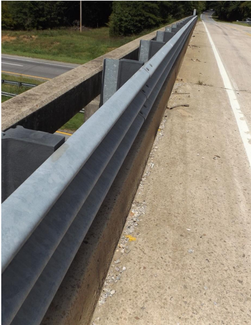
Figure 9 – Bridge Railing

The bridge railing (Figure 9) is a concrete railing on a concrete curb with guardrail attached to it and showed minimal signs of deterioration.