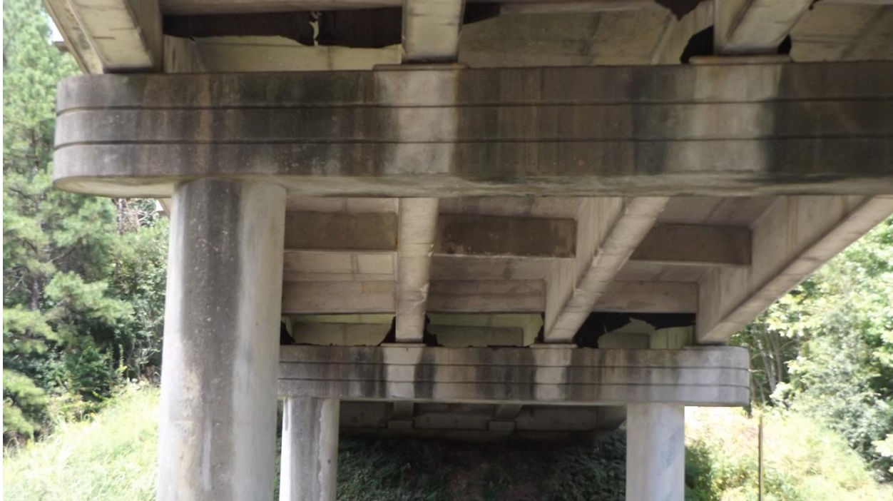
Figure 6 – Superstructure (from underneath)

The existing reinforced concrete beams were assessed from accessible areas on the ground for deterioration and cracks. No deterioration or cracks were observed from the ground. The most recent Bridge Inspection Report does document some cracking in the beams.