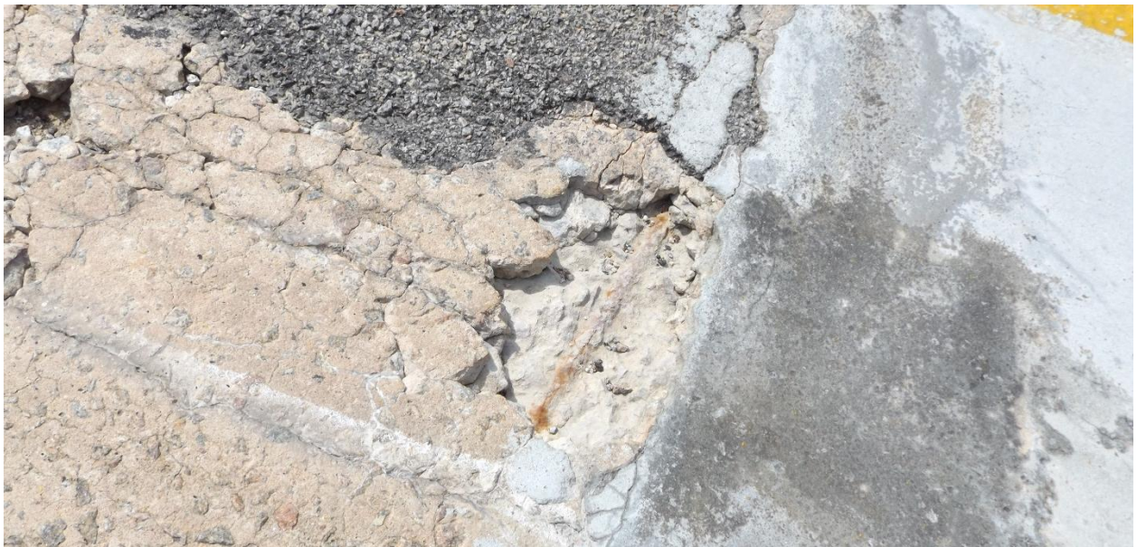
Figure 5 - Exposed Rebar in Concrete Deck